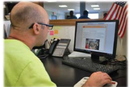
An individual at CW Resources uses an online work-readiness program specifically designed to train adults with significant disabilities.