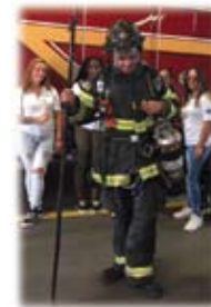
Students participated in a "Walking Tour of North Main Street, Bristol" which included presentations at the Bristol Fire Department, Bristol Police Department, United States Post Office and a lunch conversation with the Mayor and other city officials.