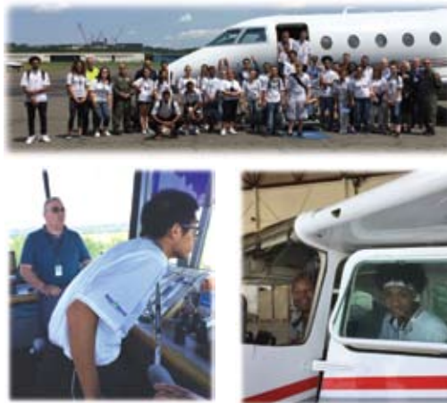
WSWEP students visited Oxford Airport to learn about careers in aviation and airport management operations.