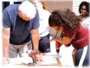
Girls in the Boys and Girls Club of Bristol's Entrepreneurial Program learn how to use different tools.

A community needs discussion was facilitated during the forum to gain insight into the current critical needs and issues local girls and women face. According to Imagine Nation,