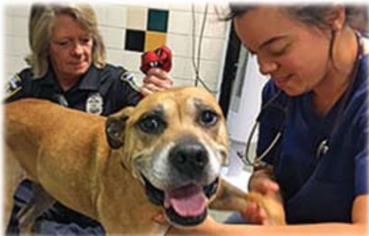
A grant from the Elizabeth I. and Louis J. Matt Animal Protection Fund allowed George, injured and abandoned in a Plainville park, to be brought to the CT Humane Society for surgery and recovery.