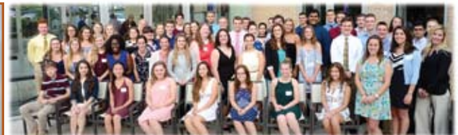
2017 Scholarship Recipients

Thanks to you, Main Street Community Foundation has awarded over $1,045,921 in scholarships and grants through the first nine months of 2017. For a full list of grants awarded from all funds to date, visit www.mainstreetfoundation.org/grants-awarded .