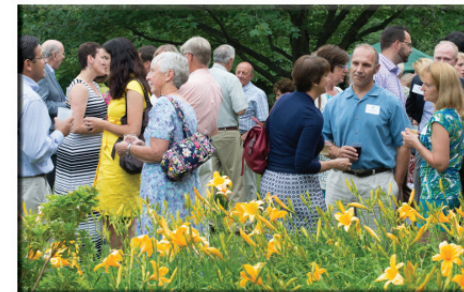
2015 Friends Reception