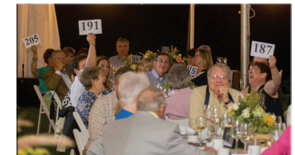
Live Auction Bidders

For more photos of the memorable evening, visit the Foundation's Facebook page, www.facebook.com/MainStreetCommunityFoundation .