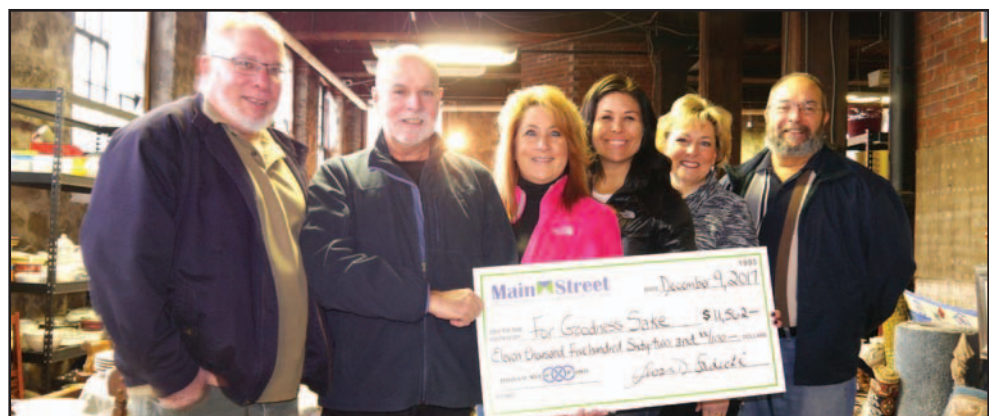
The Broad View Fund makes a donation to For Goodness Sake.

on The Broad View Fund or the Main Street Community Foundation, call (860)583-6363 or visit www.mainstreetfoundation.org .