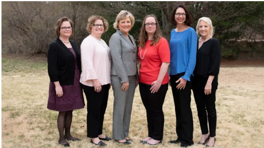
Main Street Community Foundation Staff

Main Street Community Foundation will continue COVID-19 response and recovery efforts into 2021 and beyond. The Foundation encourages individual donors, businesses and other funders to consider a contribution to the COVID-19 Response Fund if they are able, at mainstreetfoundation.org/covid19-fund .