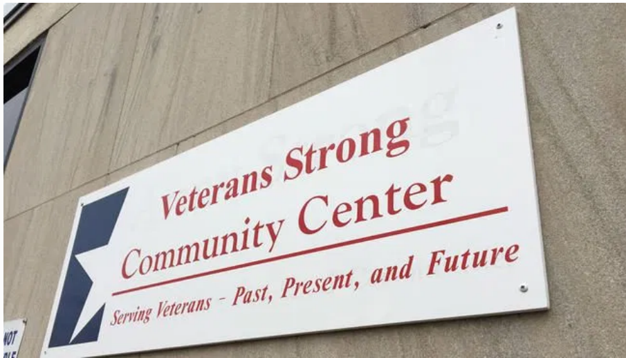
Veterans Strong Community Center Bristol CT.