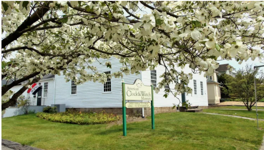
American Clock & Watch Museum Bristol CT.