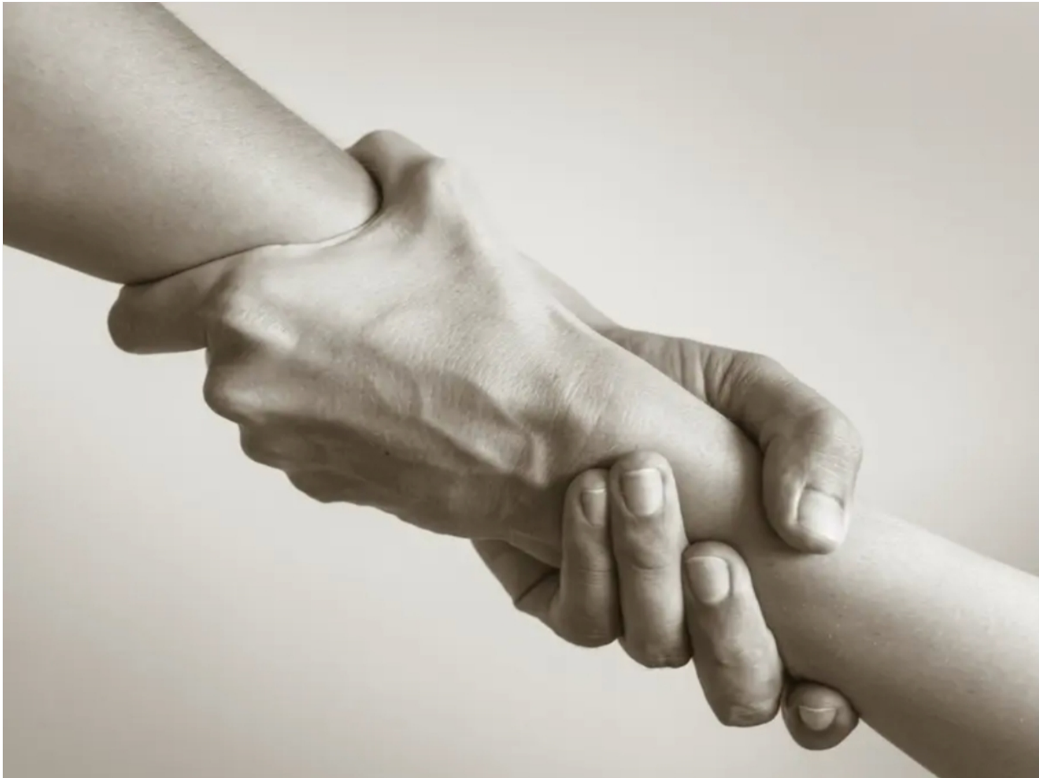
A nonprofit that pairs people in need of at-home help with volunteers is bringing its services to Southington after receiving a local grant.

SOUTHINGTON, CT — A Connecticut nonprofit that matches volunteers with people who need help at home has received a $5,000 grant to bring its services to Southington.