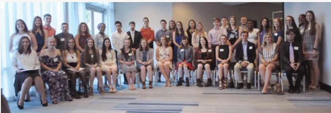
Scholarship recipients gather after the Main Street Community Foundation's annual scholarship reception.