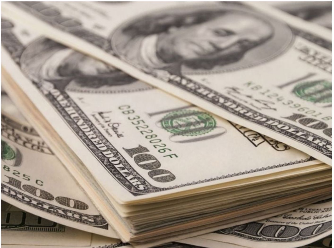
A local foundation has been surprised with an anonymous bequest.

SOUTHINGTON, CT — A local foundation has been surprised with an anonymous bequest of more than $1 million.