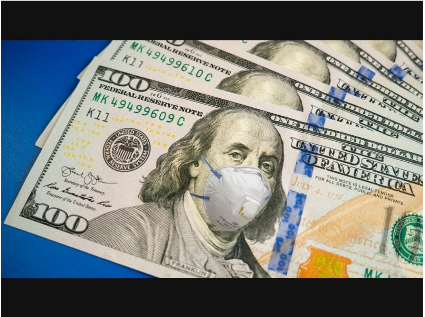
The Main Street Community Foundation (MSCF) has recently surpassed $1 million in grants awarded for covid-19 relief in Bristol, Burlington, Plainville, Plymouth, Southington and Wolcott.