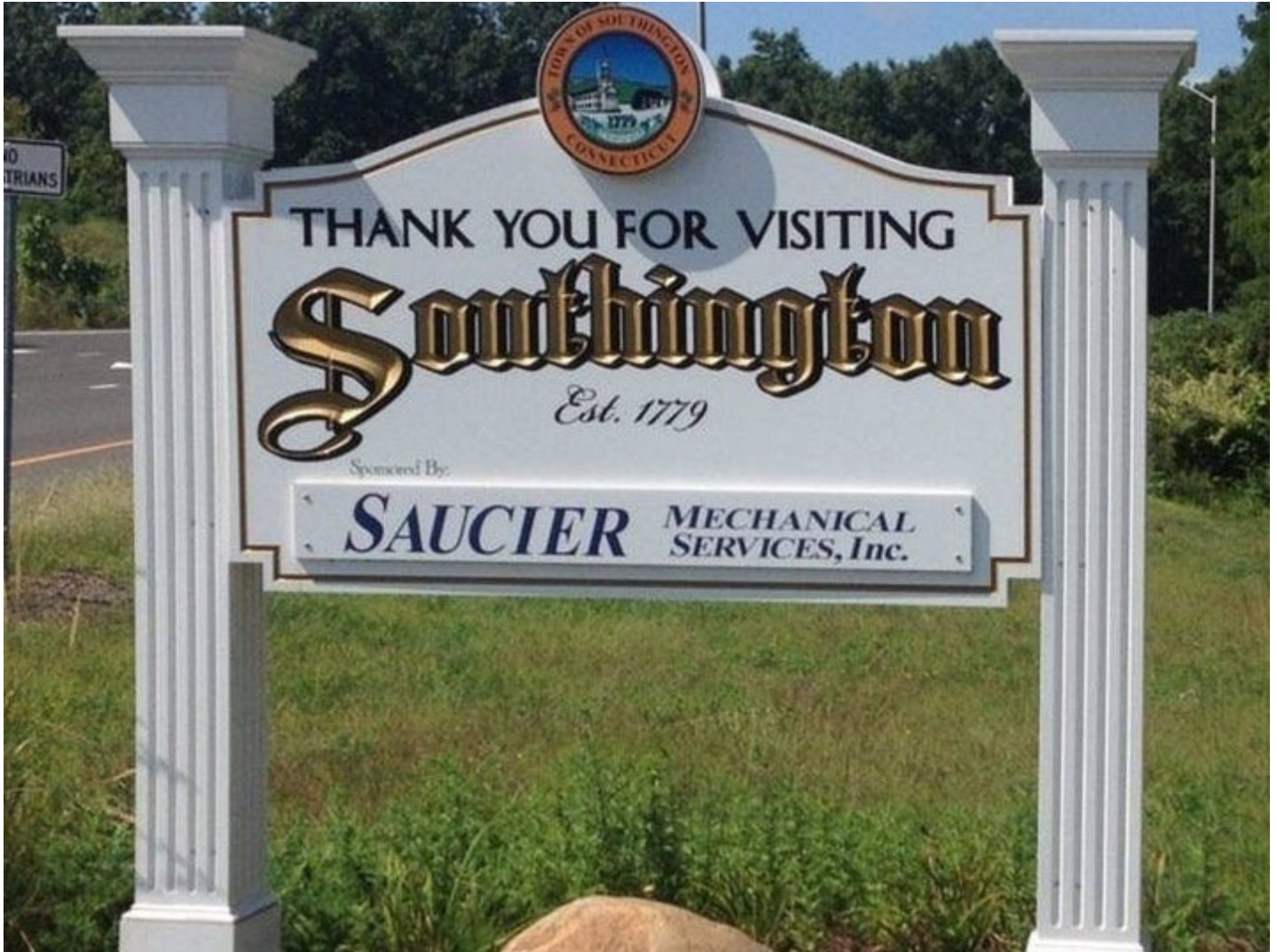
The Main Street Community Foundation has launched Phase 3 of its Coronavirus Response Fund grant program.

SOUTHINGTON, CT — The Main Street Community Foundation has launched Phase 3 of its Coronavirus Response Fund grant program.