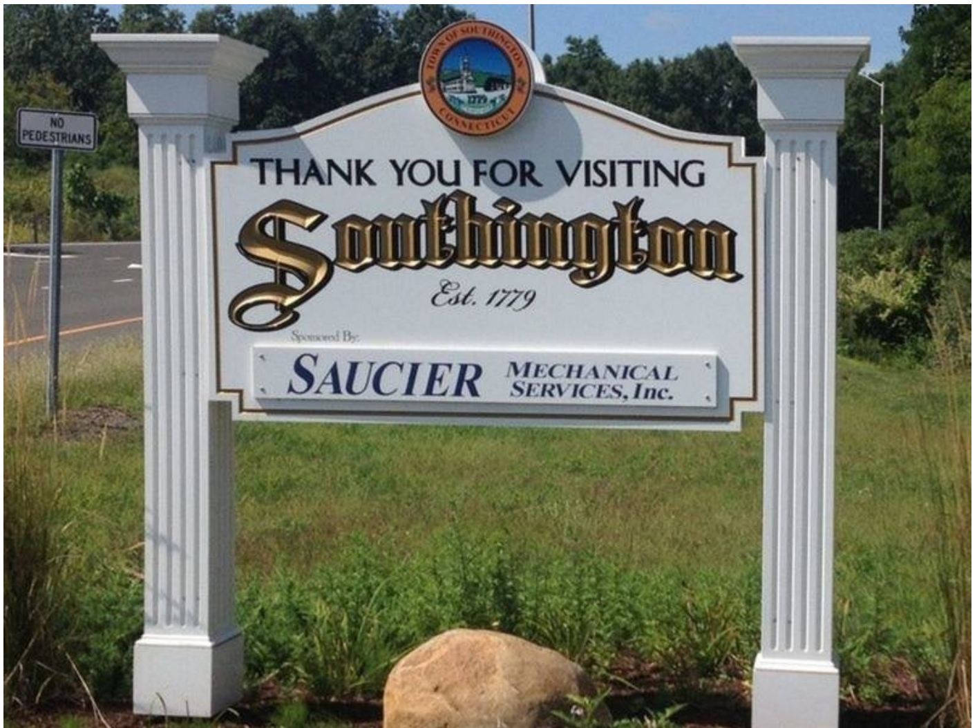
The fund Established in memory of a Southington Girl is set to award its first scholarship.