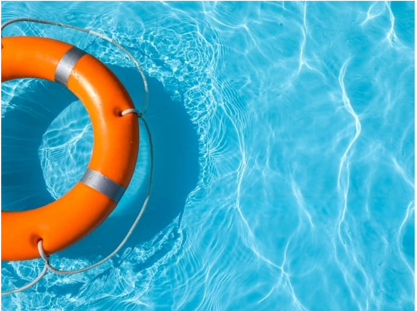
Summer fun is starting to heat up.