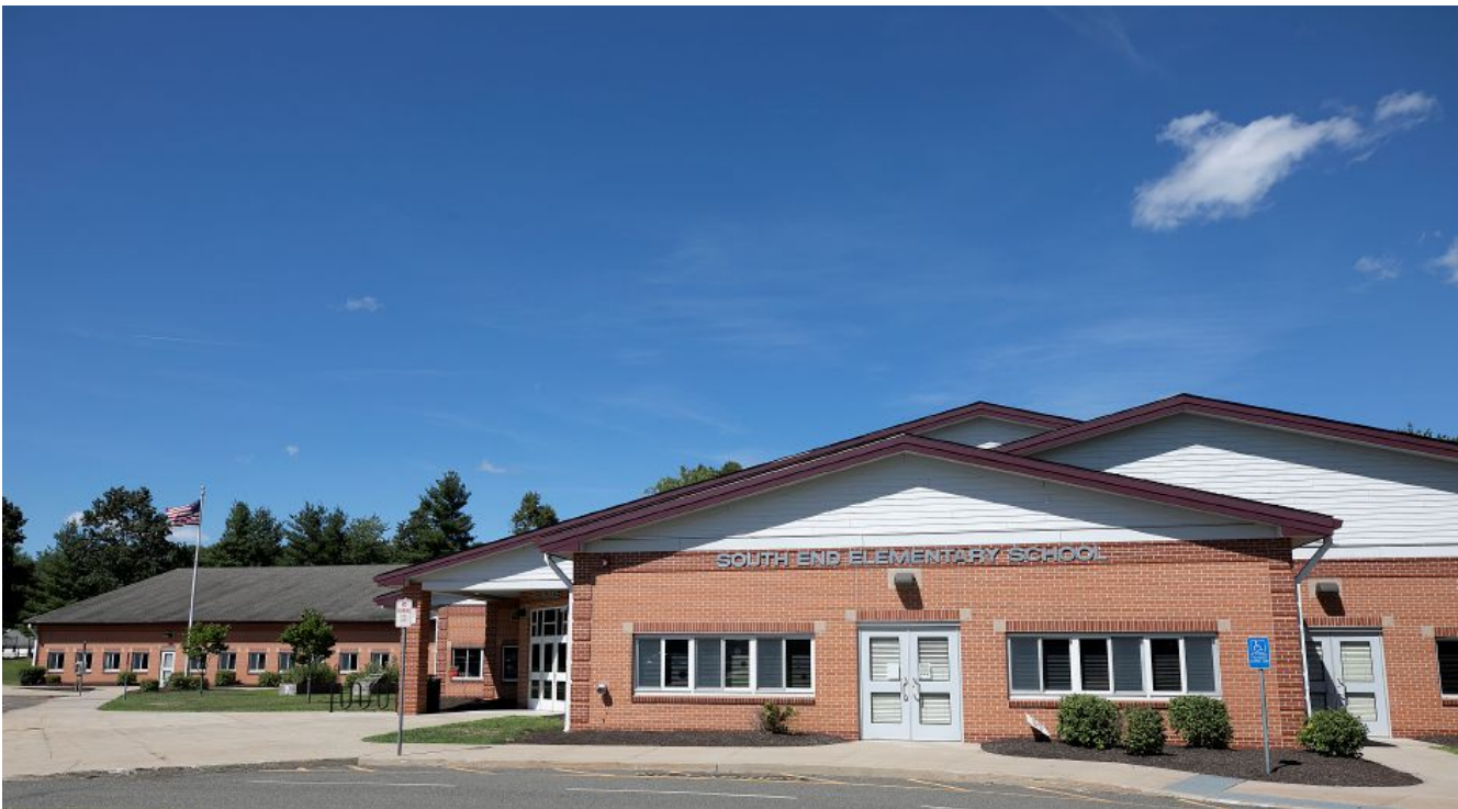
South End Elementary School in Southington, Thursday, Sept. 1, 2022.