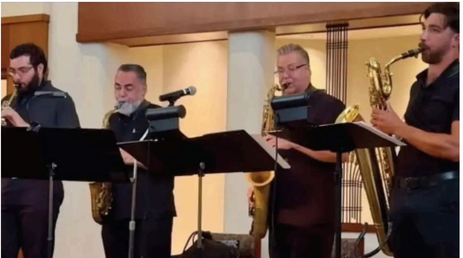
The Infinity Saxophone Quartet will perform at Congregational Church of Plainville, UCC's C.C.P. presents... Music & Creative Arts series on April 19, 2026, at 3 p.m.

For more information about the performance sponsored in part by a grant from the Elizabeth H. Norton Trust, contact the Church Office at 860-747-1901 or churchoffice@uccplainville.org or visiting uccplainville.org .