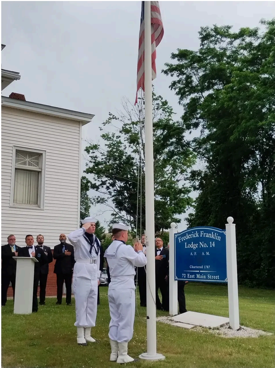
Members of the Silver Dolphins of Naval Submarine Base New London during the flag-retiring portion of a Flag Day ceremony held on June 14, 2026, at the Masonic Temple in Plainville.