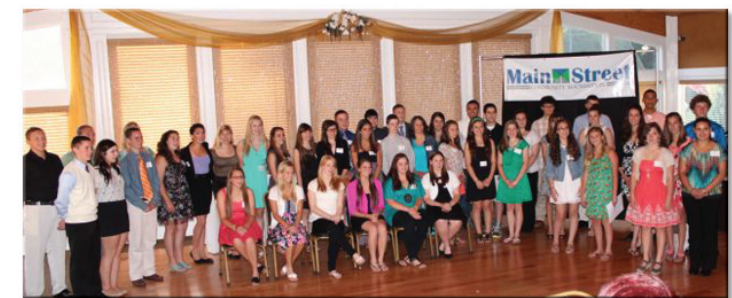
2013 Scholarship Recipients

The Community Foundation also awarded grants through a competitive process from three community endowment funds at the Foundation that were started by a group of residents in a local community to benefit that community. Those funds are