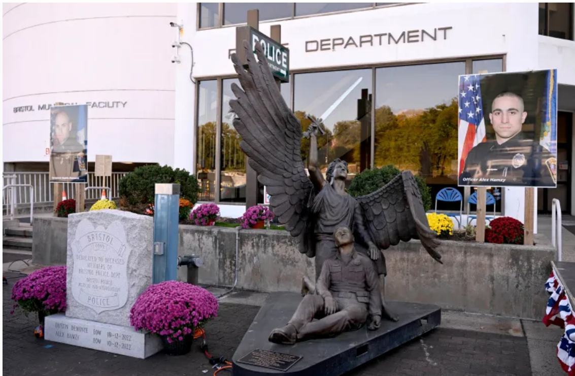
The bronze statue of St. Michael the Archangel — the patron saint of law enforcement — was on display in front of the Bristol Police Department.

The public vigil Thursday evening was just one of several ways Bristol police this week honored their fallen brothers. The department members attended two memorial services for each officer earlier in the day that were not open to the public.