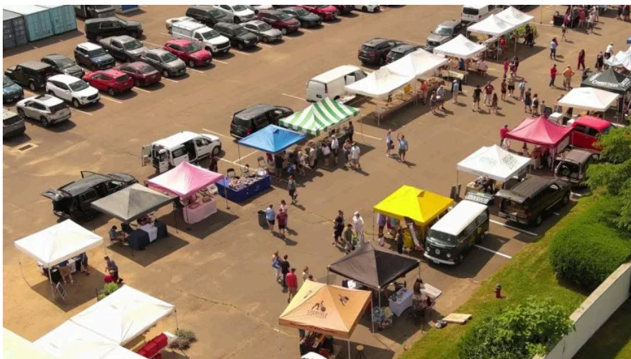
An aerial view of Bristol Farmers Market opening day June 21, 2025.

POSTED BY: DAVID FORTIER NOVEMBER 13, 2025