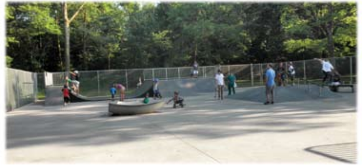
Plainville's Sk8Park received additional equipment with support from the Plainville Community Fund.

The Plainville Community Fund was established in 2006 by a group of dedicated community leaders, is an endowed fund at the Main Street Community Foundation. The fund was created to provide a permanent source of funding for the charitable projects and programs that will enhance the quality of life for the Plainville community.