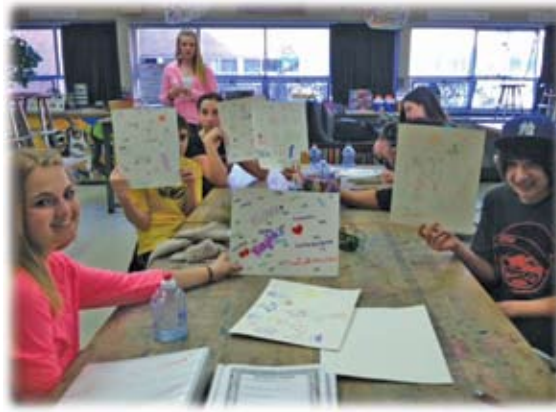
Success Café students at Kennedy Middle School in Southington work on their "All About Me" projects that they will share with the rest of the group.

To support an after school confidence/character building program called Success Café for middle school girls in Southington.