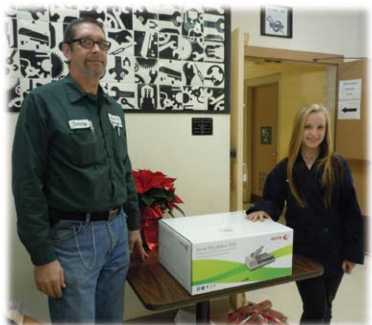
Bristol Technical Education Center students accept a new scanner to assist with the development of career portfolios.