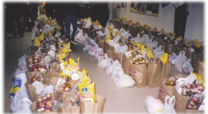
Holiday baskets at Plainville Community Food Pantry to be distributed to residents in need.