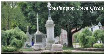
Southington Town Green

SCHOLARSHIP FUNDS: These funds enable a donor to establish a named fund for any level of education. Donors may designate a particular school, field of study and select eligibility criteria.