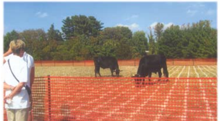
A spectator watches the cows at the PLAINVILLE COMMUNITY FUN(d) DAY's "Cow Chip" contest.