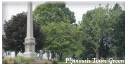
Plymouth Town Green

FIELD OF INTEREST FUNDS: These funds allow donors to support a broad category of need such as the arts, healthcare, education, environment or a geographic area. Grant recipients are selected by the Foundation's Distribution Committee.