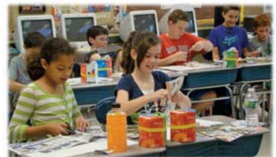
Students at Har-Bur Middle School in Burlington participate in the Moonjars program.