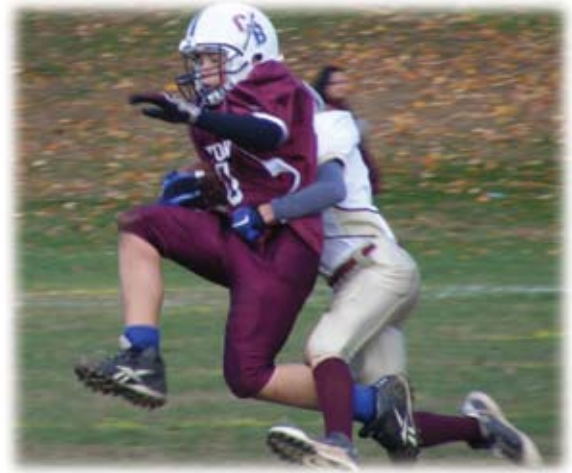
Burlington players participating in the Canton/Burlington Youth Football program received new football helmets with support from the James R. Parker Trust.

To support the purchase of a laptop for the Discovery Education curriculum. Fuller & Myrtle Barnes Fund for Education