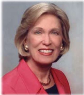
Barbara Hackman Franklin