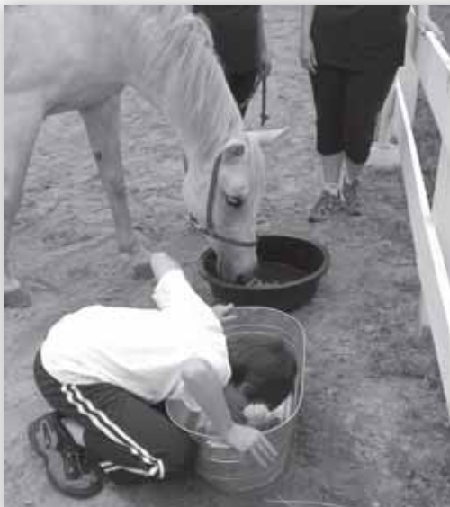
Student rider from Shepard Meadows Therapeutic Riding Center bobs for carrots with his horse on the last day of spring semester, which was called "Horse Show Day."