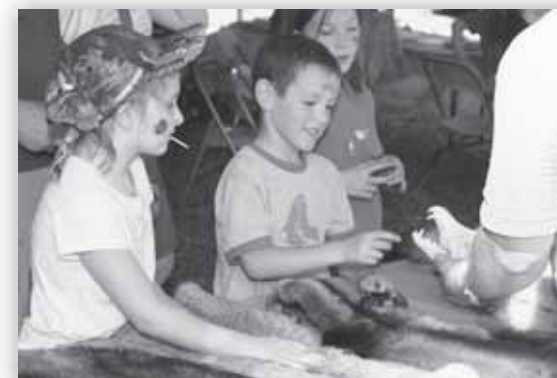
Children participate in hand-on wildlife quiz on Appreciation Day at Sessions Woods.