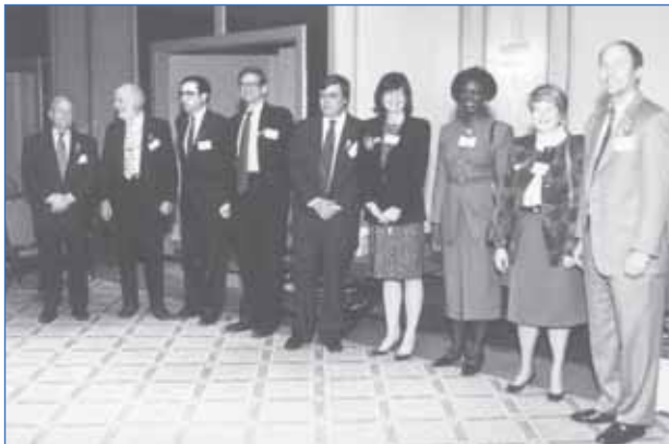
Original Board of Directors in 1996

Assets reach $24.3 million and 93 charitable funds