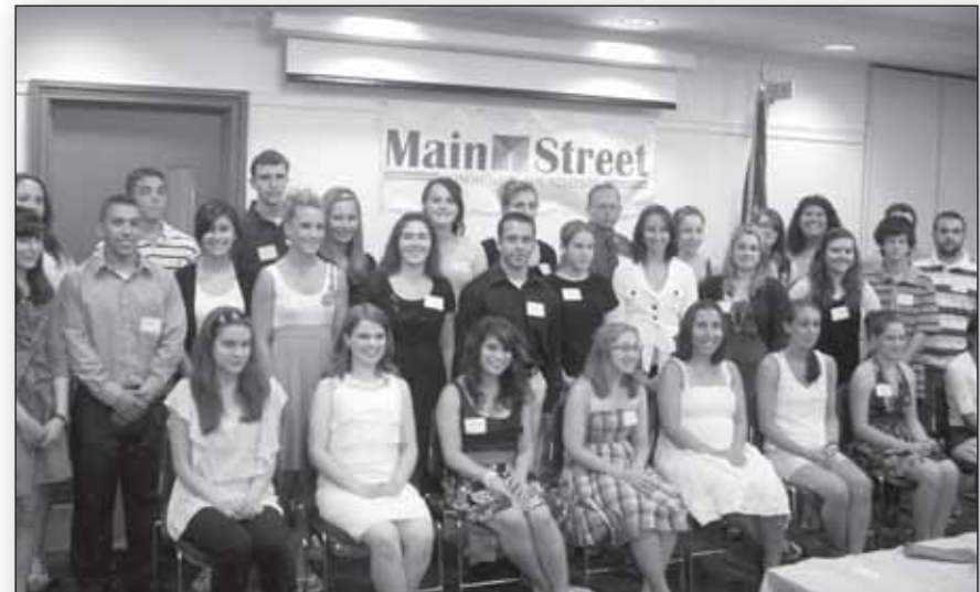
2010 Scholarship recipients were honored at the Foundation's Scholarship Reception held on June 24, 2010 at the Bristol Public Library.