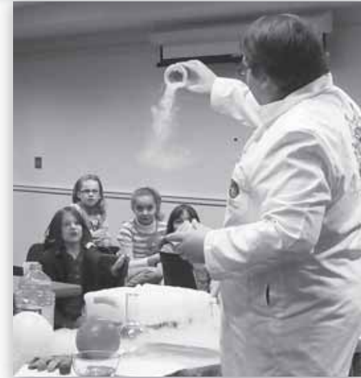
Girls in grades 3-5 attend a science workshop learning about dry ice from Professor Flux of Mad Science, a program sponsored by the Friends of the Plainville Library with a grant from the Women & Girls' Fund.

Total Women & Girls' Fund Distributions $20,000