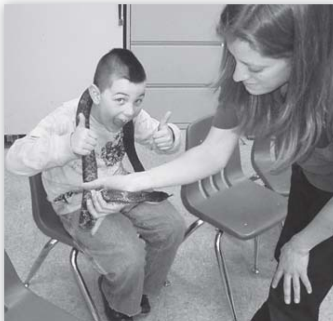
O'Connell School second grader learned about life cycles at Indian Rock as part of the grant-funded extended learning program to enhance science learning for students.

Established in 1999 to support the ongoing charitable needs of the Burlington Library.