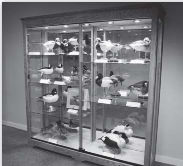
Friends of Sessions Woods received a grant to fund an educational exhibit about the native waterfowl species of Connecticut.