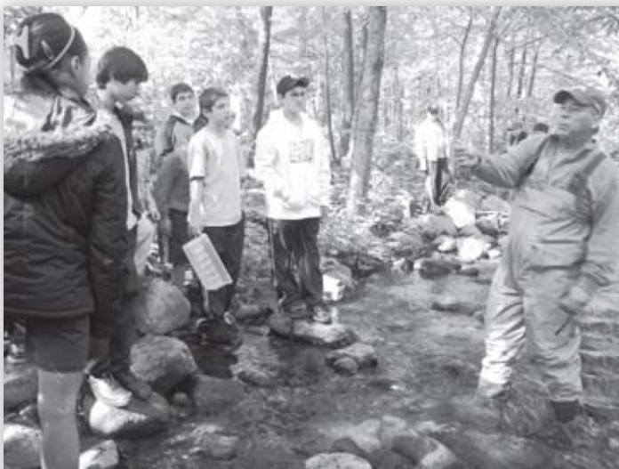
St. Anthony School students of Bristol take a trip to the river as part of the Trout in the Classroom program.

To fund the Trout in the Classroom program at St. Anthony School in Bristol Merriman Family Fund Gnazzo-Reidy Fund