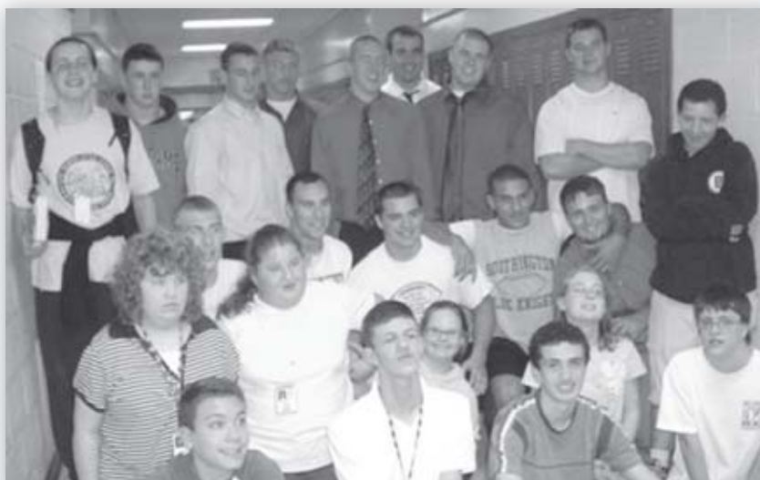
Best Buddies match party at Southington High School.

ADMINISTRATIVE ENDOWMENT FUND GRANTS Main Street Community Foundation $41,172 Barnes Group, Inc. 150th Anniversary Fund Bristol Savings Bank Fund Main Street Community Foundation Endowment Fund Dave and Edith Scarritt Fund Yarde Metals Community Fund