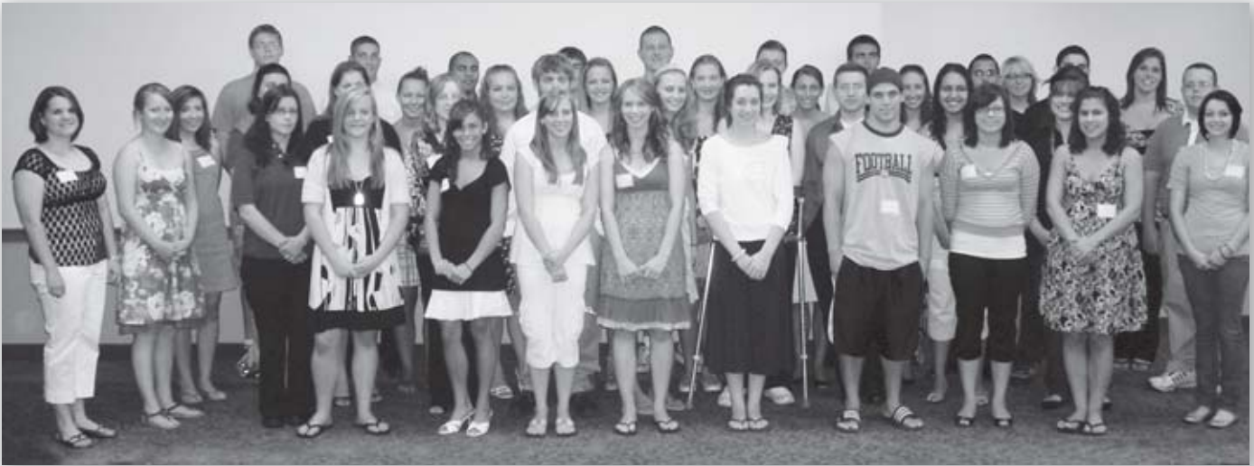
2008 scholarship recipients were honored at the Foundation's Scholarship Reception held on June 26, 2008 at the Bristol Public Library.