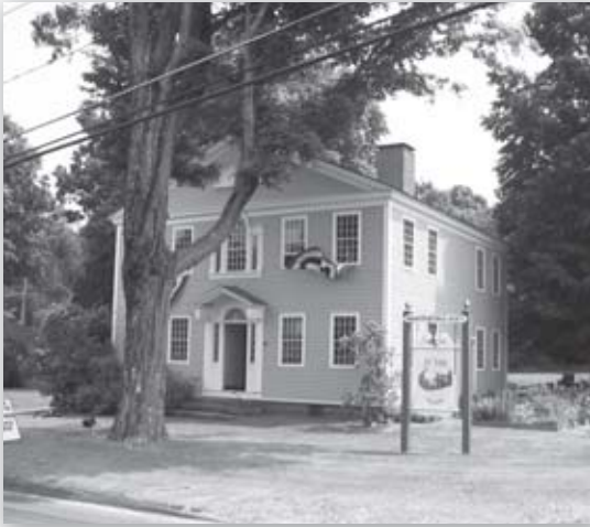
Burlington Historical Society