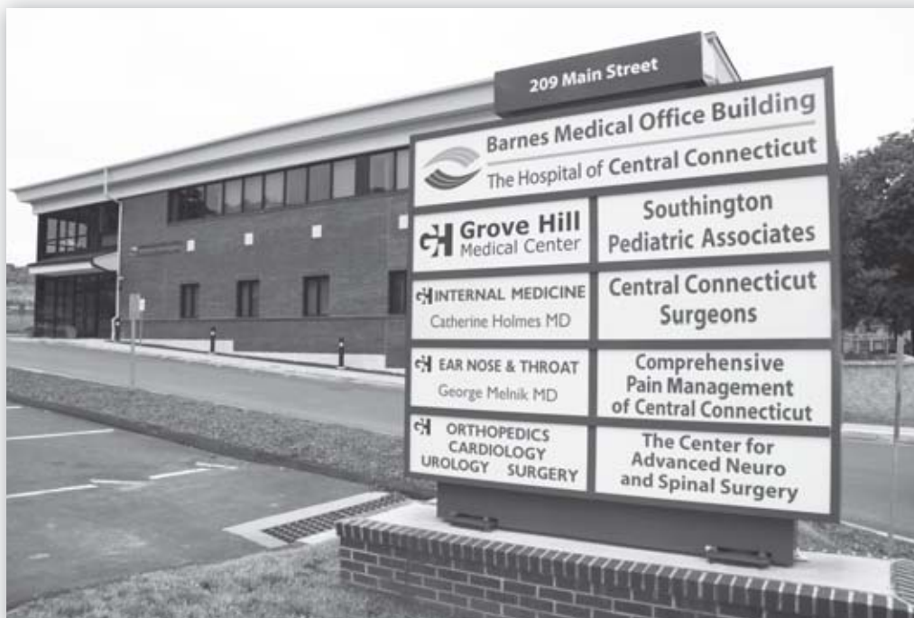
Barnes Medical Office Building, completed in 2007 with loan from the trust