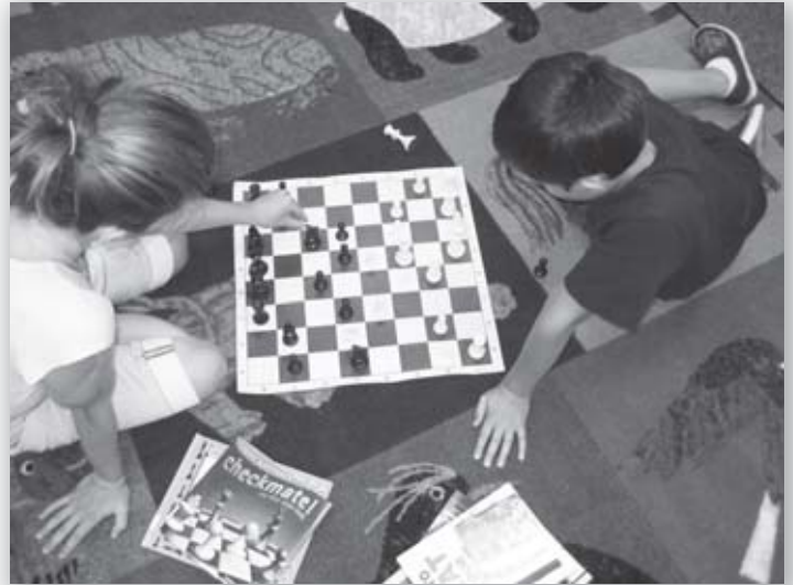
Participants in the Terryville Public Library Youth Chess Club learn the game on new chess boards.

To support the implantation of a clinic wide electronic health record system. Bristol Brass General Grant Fund