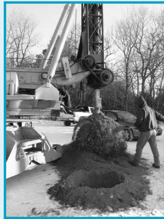
Construction begins at Nassahegan in late 2006